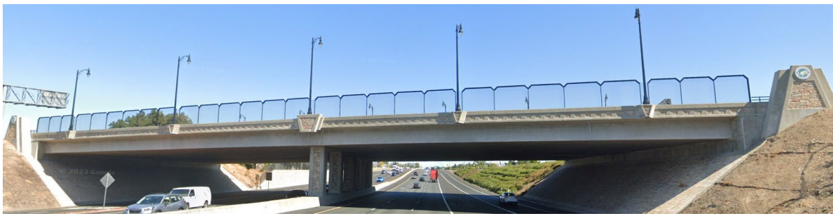
Figure 1: Existing Sheldon Road Overcrossing