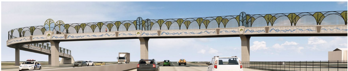
Figure 3: "Creek & Trees" Conceptual Rendering

The project's environmental document is being finalized and prepared for public circulation. Construction is anticipated to begin in Summer 2026, and it is anticipated to be completed by the end of 2027.