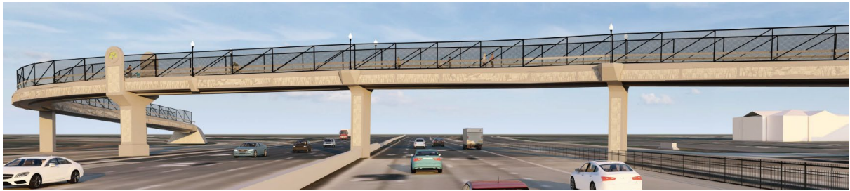
Figure 2: "Traditional Truss" Conceptual Rendering