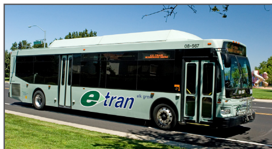
City e-Tran Bus