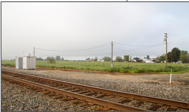
Railroad Tracks near Elk Grove

The City views light rail (or other high-frequency transit, such as bus rapid transit) as an important part of the overall transit plan for Elk Grove, including the use of light rail to connect workers to current and future employment centers in the City. The planned route for light rail service is illustrated on the Transportation Network Diagram in Chapter 3. However, current funding constraints must be addressed to advance planning and construction efforts. The City will work closely with SacRT, SACOG, and other jurisdictions in the region to identify funding strategies and other resources that could advance the services and infrastructure.