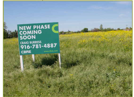
Development in Elk Grove

It is part of Elk Grove's vision to play a unique and active role in the region. In terms of the economy, that goal consists of two parts. First, Elk Grove seeks to better establish itself in the regional market as an activity and employment center by attracting additional high-quality jobs, enhanced amenities, visitation, and additional tax revenue to the City. Second, Elk Grove seeks to support the economic growth, circulation, and sustainability goals established for the region. To achieve the former, the City will encourage the growth of businesses in targeted industries and at targeted locations by providing a regulatory framework, business support, and infrastructure to attract these new businesses. To achieve the latter, in addition to local activities, the City will work to meet the goals set by regional plans.