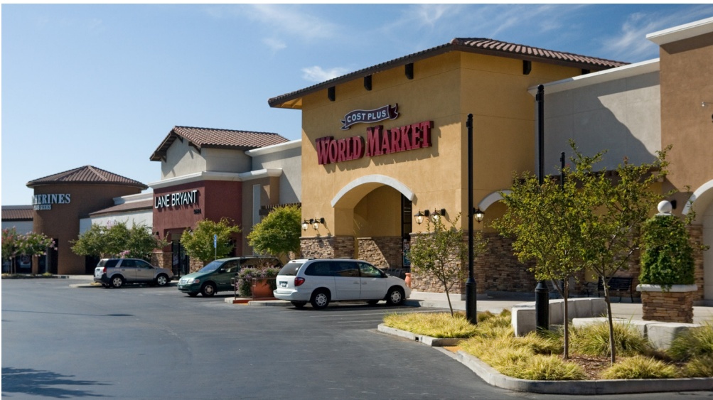
Commerce in Elk Grove