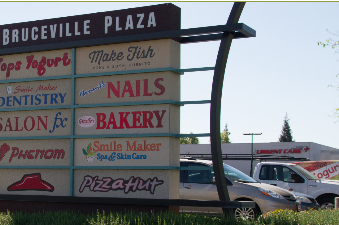
Commerce in Elk Grove

Our Regional Neighbors Know Us & Our Contributions. This principle speaks to Elk Grove’s place and function within the larger Sacramento region, and relationship to nearby regions such as San Joaquin Valley, the San Francisco Bay Area, and Silicon Valley. Since the economy in Elk Grove is strongly influenced by regional factors and trends, the policies in this chapter aim to enhance the City’s prominence in the regional economy in a variety of ways. These include establishing a major regional employment center in Elk Grove pursuant to the regional transportation and land use strategy (discussed in further detail on pages 5-8 and 5-9); improving coordination between the City and regional agencies and organizations on economic development matters; and strengthening Elk Grove’s linkages to the regional transportation network to support local economic development.